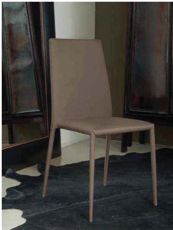
sedia chair MALIK cod. 40.07 TT002 tessuto tecnico fango / mud technical fabric