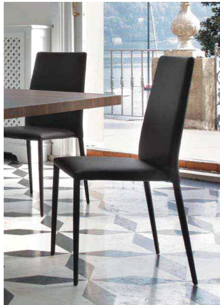
sedia chair MALIK cod. 40.07 TR503 pelle ecologica testa di moro / dark brown ecoleather