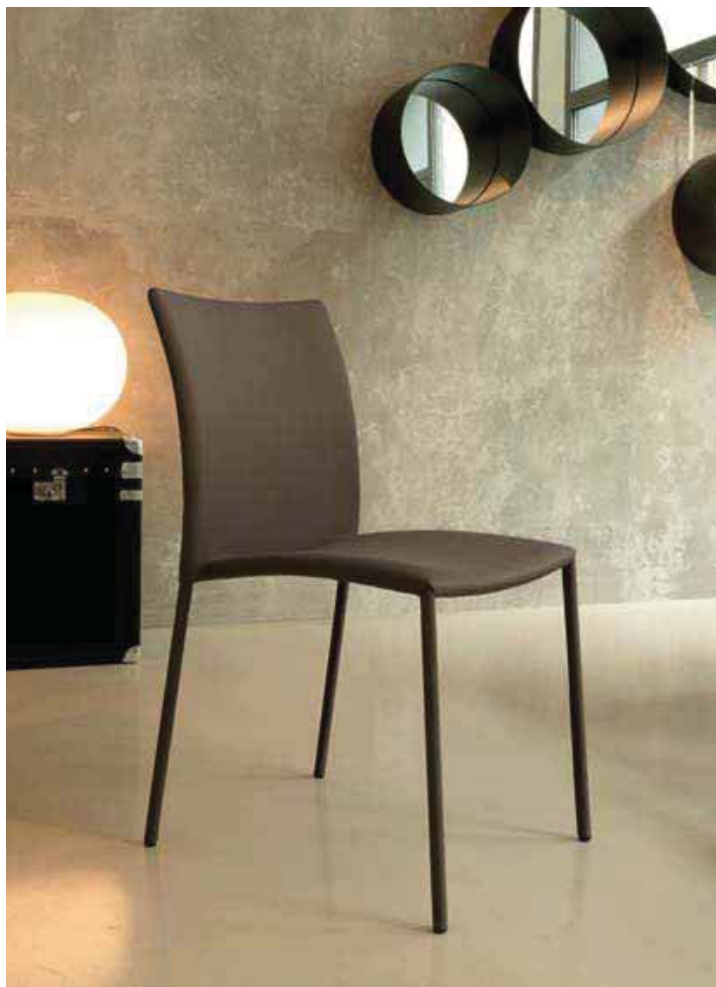
sedia chair SIMBA cod. 40.06 TT002 tessuto tecnico fango / mud technical fabric