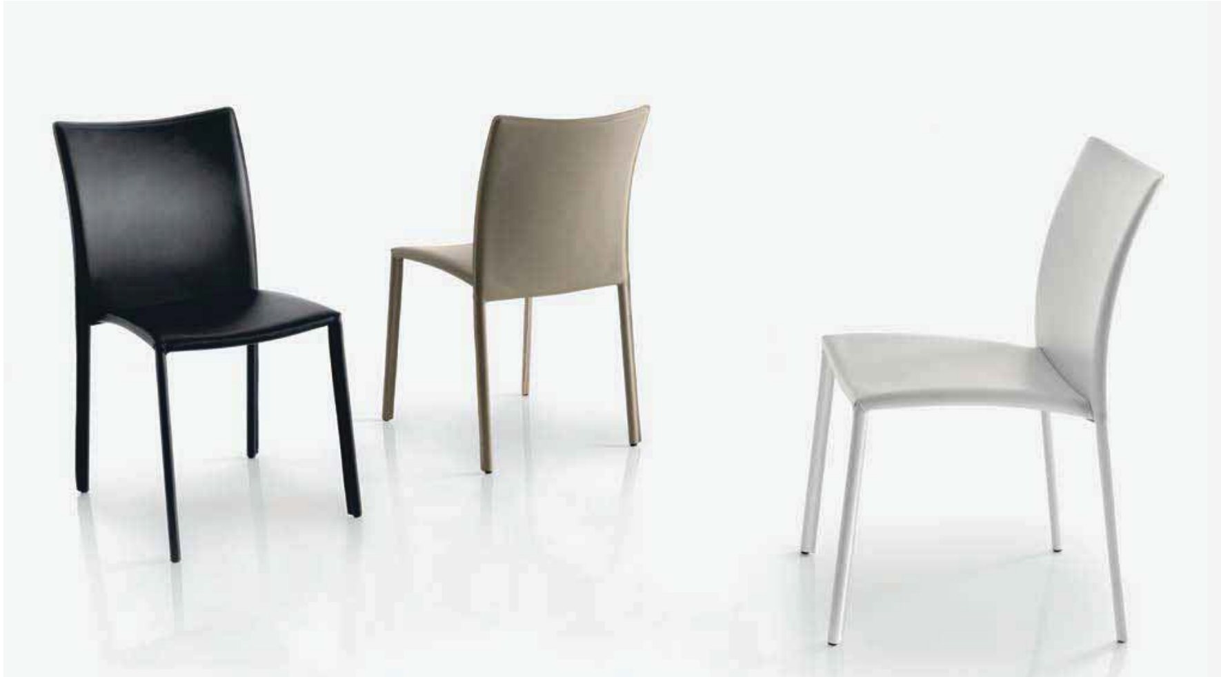
sedia chair SIMBA cod. 40.06 J055 fibra di cuoio nero / black leather fibre J056 fibra di cuoio sabbia / sand leather fibre J051 fibra di cuoio bianco / white leather fibre