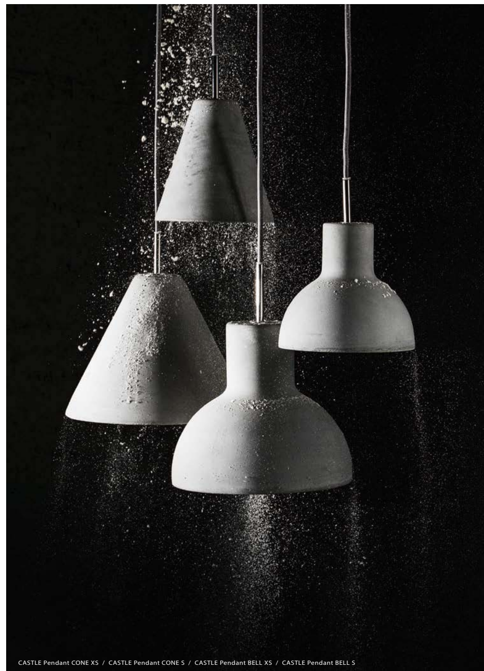
CASTLE Pendant CONE XS / CASTLE Pendant CONE S / CASTLE Pendant BELL XS / CASTLE Pendant BELL S

Materials : concrete, aluminum Color : concrete Canopy : chrome