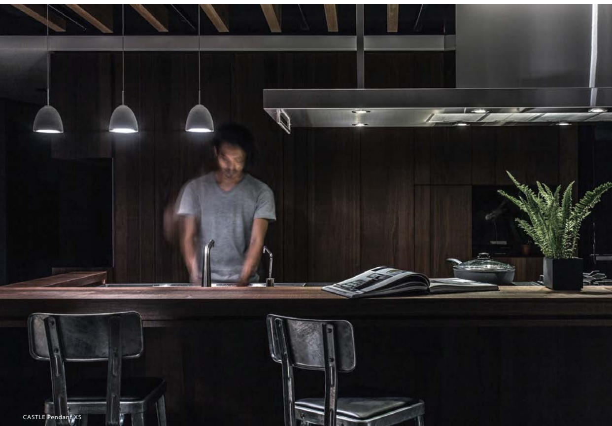
CASTLE Pendant XS