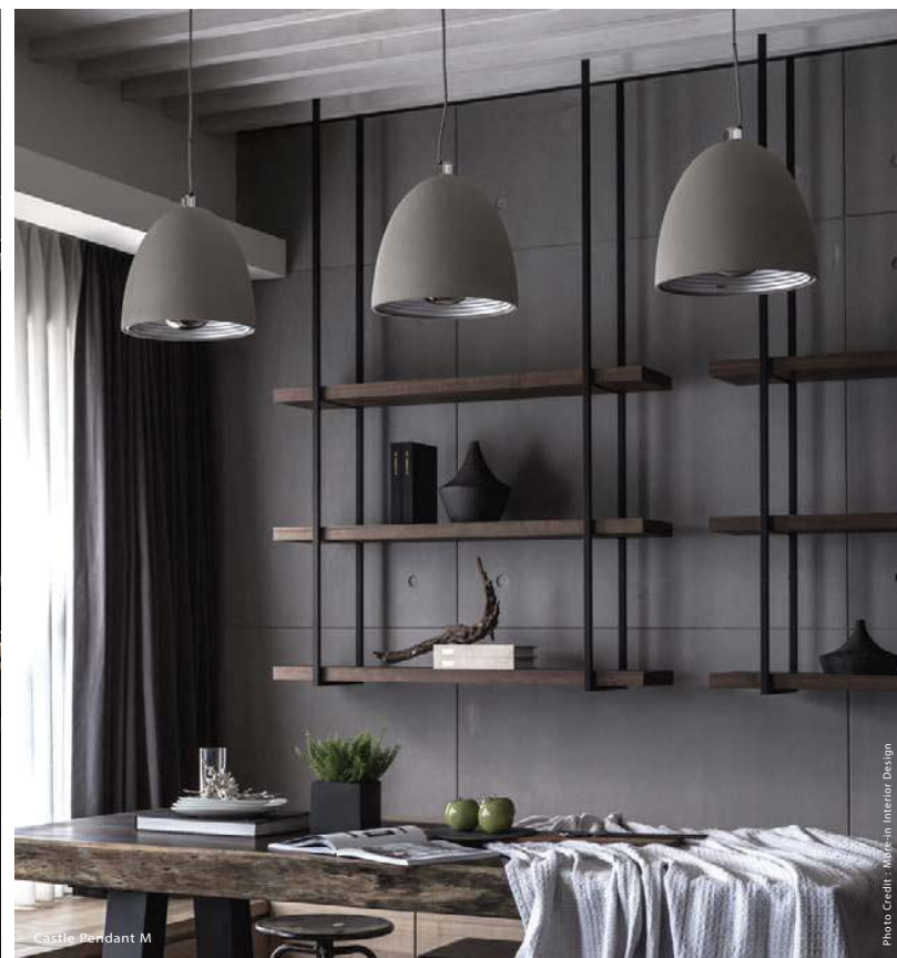
Castle Pendant M