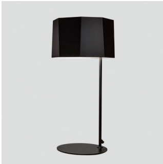
matt black w / red textile cord