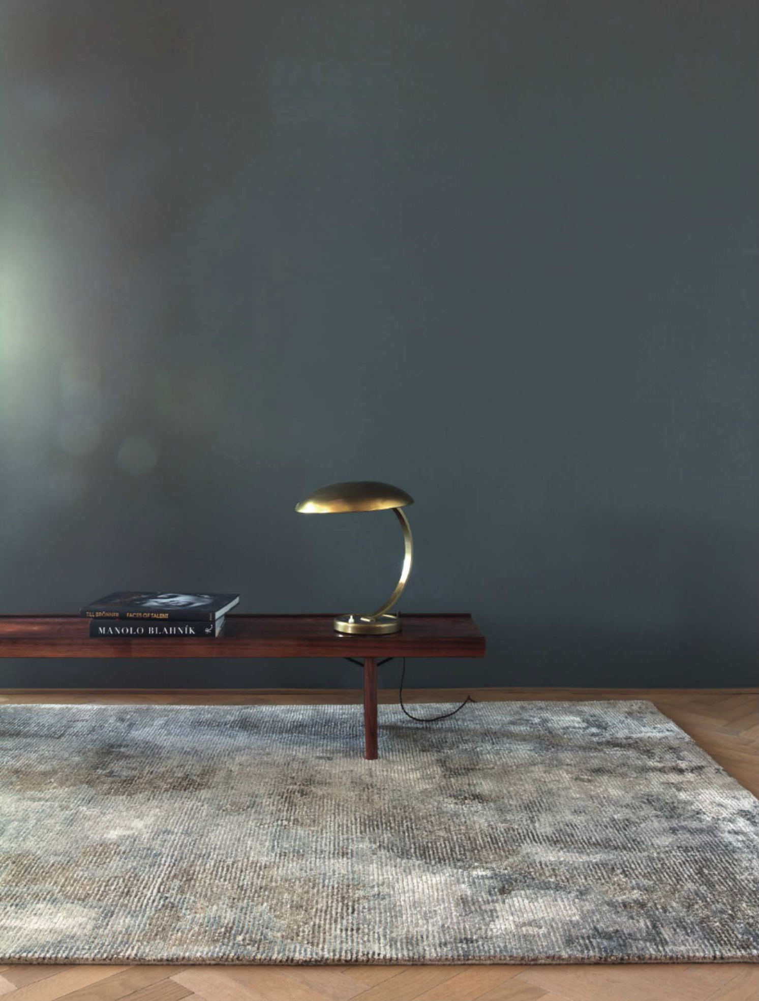
ERODE 238.001.600 NEW