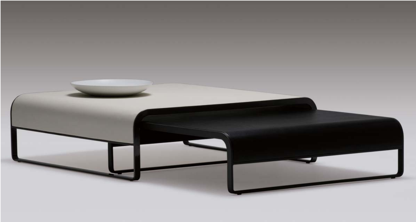
ERA / FRAME: Black fluorocarbon painted steel. TOP: Curved plywood top wrapped in P/FC or R/RS leather.