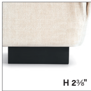
C Wood H 2 3/8" Matt black P15 Smoke P12 Canaletto Walnut P1GW