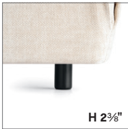
A Wood H 2 3/8" Matt black P15