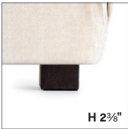
B Wood H 2 3/8" Smoke P12