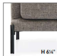
Metal STANDARD Matt black P15