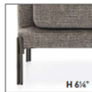
Metal OPTIONAL Black nickel P1L