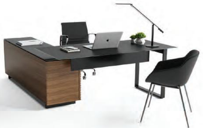
The cabinet's finished back panel allows it to float beautifully in any space.