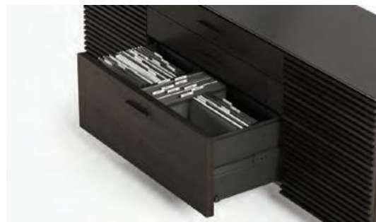
Locking file drawer holds letter and/or legal hanging files