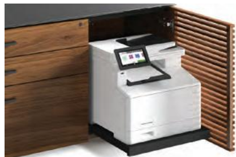
A push-to-open tray can be positioned in either side cabinet, suitable for use with an oversized printer or all-in-one