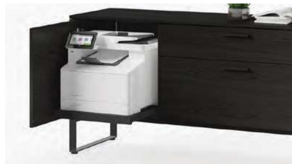
Cabinet door conceals a push-to-open printer tray, suitable for use with larger printers or all-in-ones