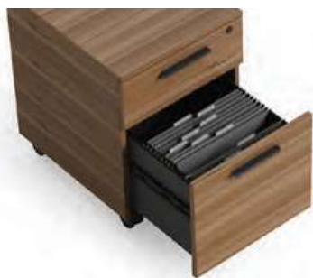
Lower hanging file drawer for letter or legal sized files