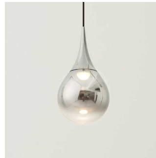
layered chrome glass + chrome cap