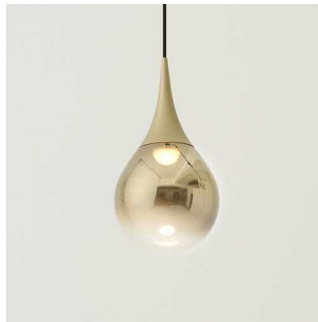
layered gold glass + champagne gold cap