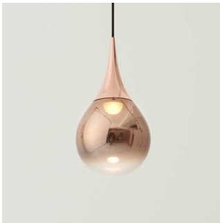
layered copper glass + copper cap