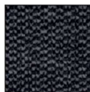
SQ1 Malmo Anthracite grey CAT. 3