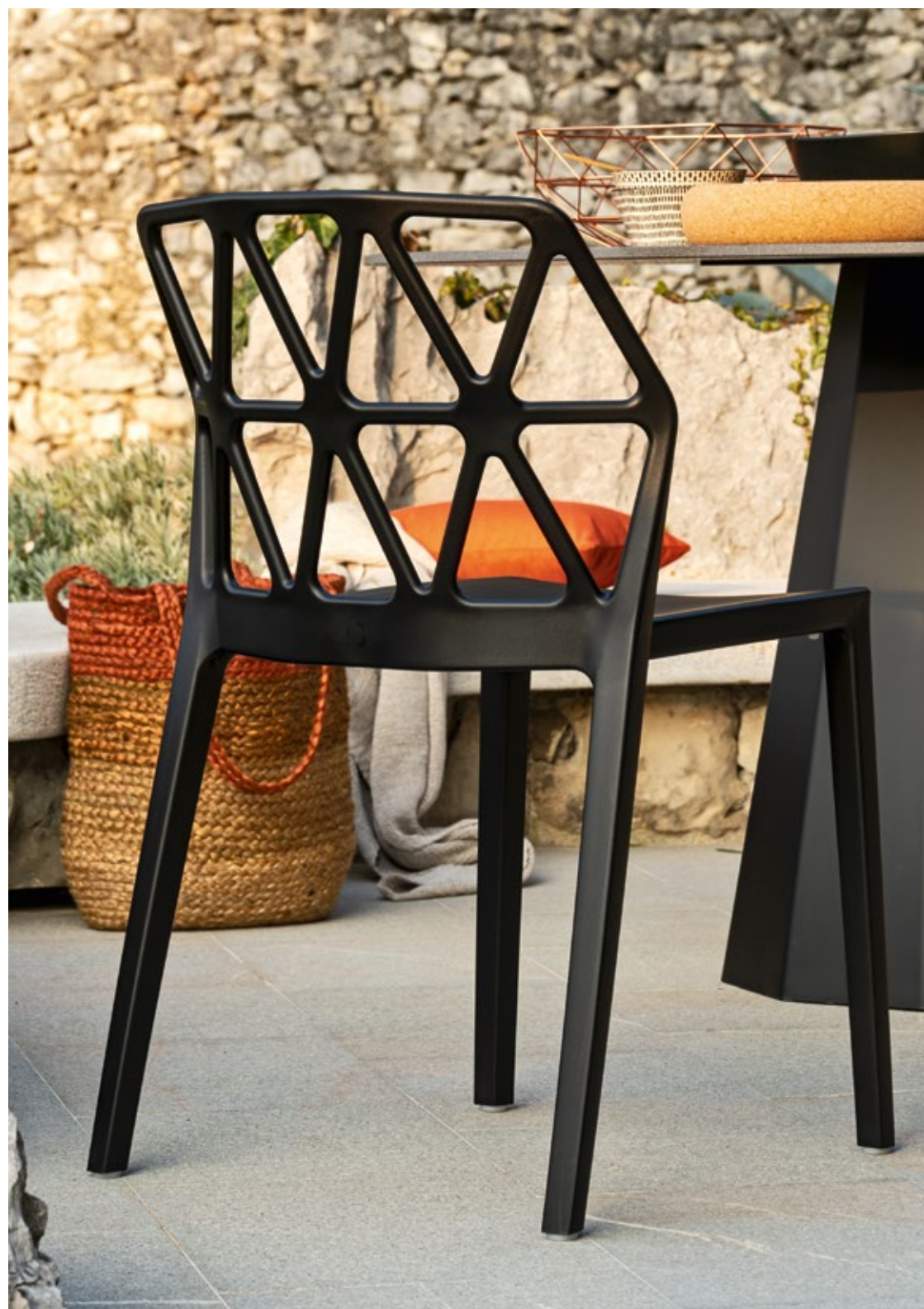
Alchemia CB1056 sedie | polipropilene P15 nero opaco - chairs | polypropylene P15 matt black Dix CB4804-FD 120 E tavolo fisso | metallo P15 nero opaco / ceramica P22C cardoso nero - non-extending table | metal P15 matt black / ceramic P22C cardoso black