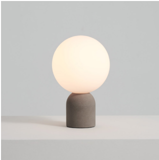
concrete gray + matt opal