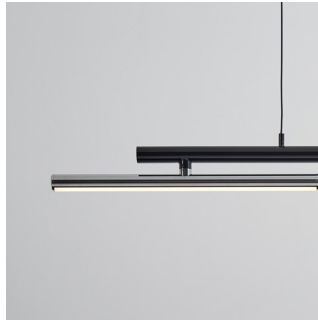
chrome + shiny black