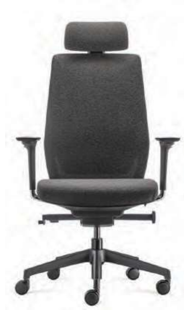
3521 BLACK/GREY & BLACK BASE

For product info and detailed specs, visit bdiusa.com/coda