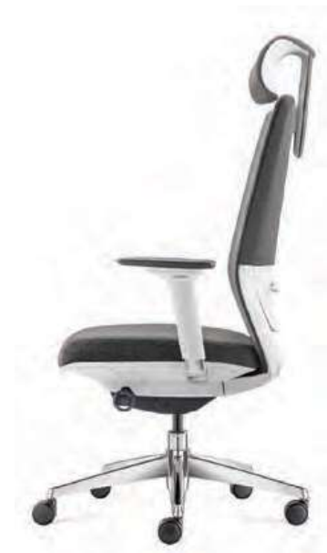
3522 OYSTER/GREY & ALUMINUM BASE