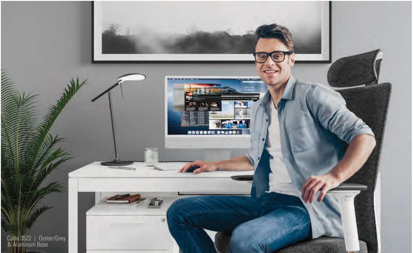
Coda 3522 | Dyster/Grey & Aluminum Base