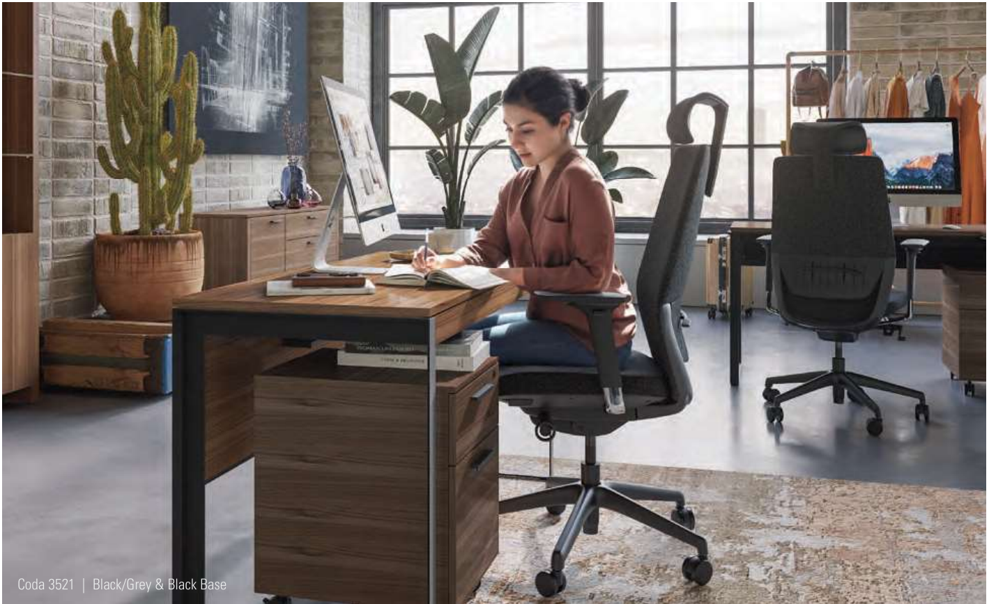
Coda 3521 | Black/Grey & Black Base