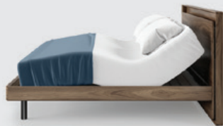
Platform Position: Low Frame Position: High Platform Height: 11 in | 28 cm (12" Adjustable Mattress shown)