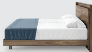
Platform Position: High Frame Position: Low Platform Height: 11 in | 28 cm (12" Mattress shown)