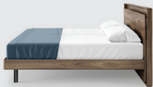
Platform Position: High Frame Position: High Platform Height: 14 in | 36 cm (10" Mattress shown)