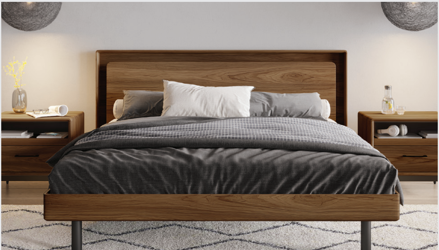
Up-Linq 9119 King Bed with 28" Nightstands