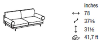
DTD2C00 2-ER SOFA