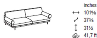
DTD3C00 3-ER SOFA