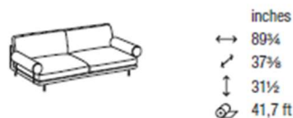
DTD2C0M 2-ER MAXI SOFA