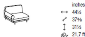
DTL1C0MS - DTL1C0MD 1-ER LATERAL MAXI ELEMENT