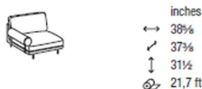
DTL1C00S - DTL1C00D 1-ER LATERAL ELEMENT