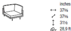
DTA1Q00 SQUARE CORNER ELEMENT