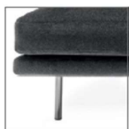
Metal Black nickel P1L