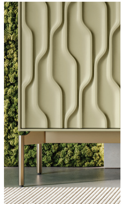
MOSS & BRUSHED BRASS