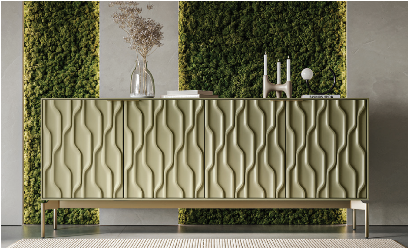
Moss with Brushed Brass legs