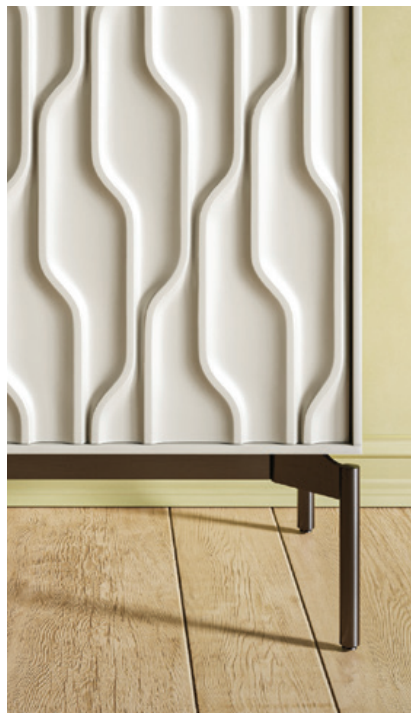
STONE & BRUSHED CARBON

Mesa cabinets are available in two finishes—Stone and Moss—and two base options—Brushed Brass and Brushed Carbon.