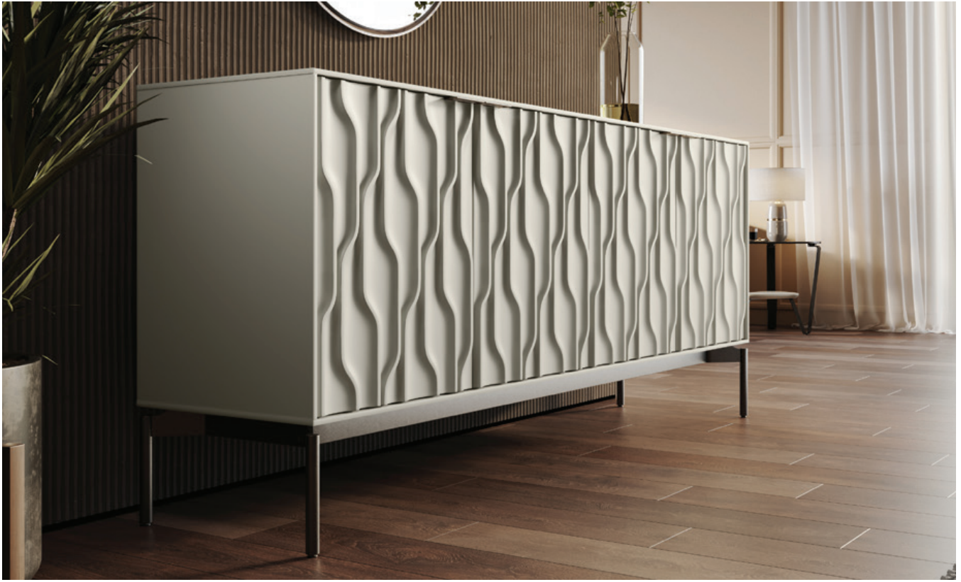
Stone with Brushed Carbon legs