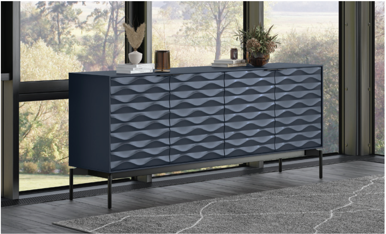
Ocean with Brushed Carbon legs