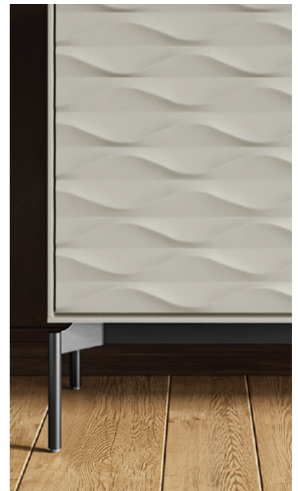
STONE & BRUSHED CARBON