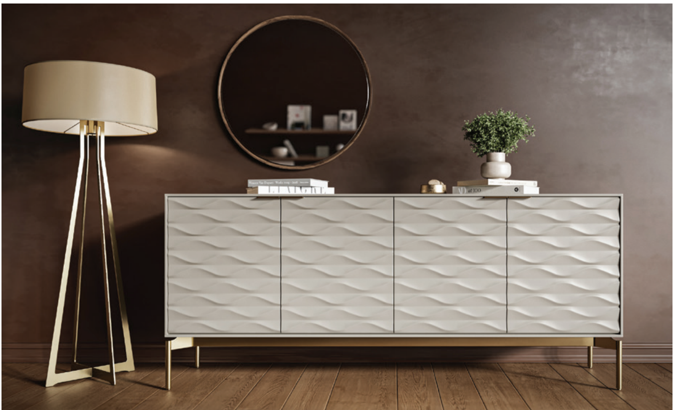
Stone with Brushed Brass legs