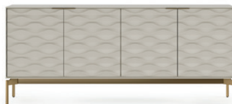
STONE & BRUSHED BRASS