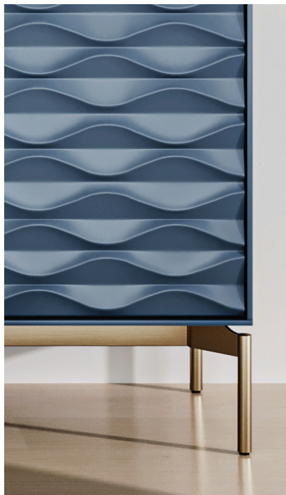
OCEAN & BRUSHED BRASS

Ripple cabinets are available in two finishes—Stone and Ocean—and two base options—Brushed Brass and Brushed Carbon.