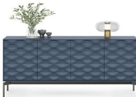
OCEAN & BRUSHED CARBON

Ripple cabinets are available in two finishes—Stone and Ocean—and two base options—Brushed Brass and Brushed Carbon.