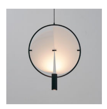
white PC + matt black