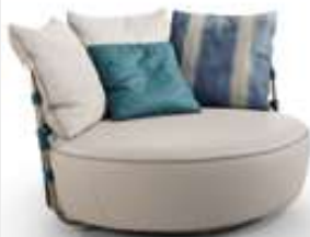
PAG. 90 - 91 Dandy Home Catalogue

Stitchings / Cuciture: CUC 512 Frame / Scocca: Brass