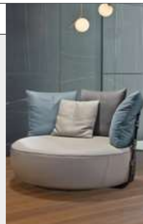
PAG. 92 - 93 Dandy Home Catalogue

Stitchings / Cuciture: CUC 512 Frame / Scocca: Titanium