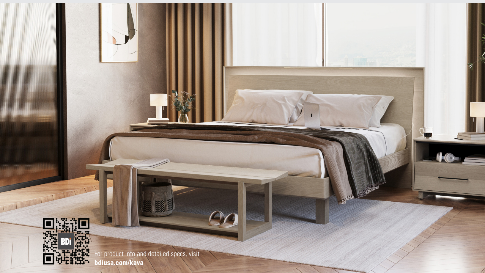
Platform Position: Low Frame Position: Low Platform Height: 8 in | 21 cm