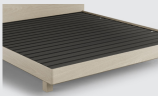
Platform Position: High Frame Position: High Platform Height: 14 in | 36 cm