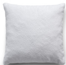
Bali color 20