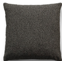
Lisbon color 01