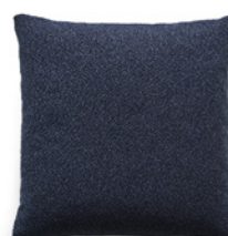
Lisbon color 14