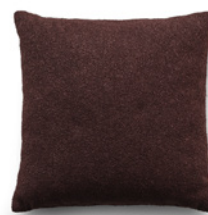
Bali color Bali 01