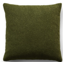
Bali color 09