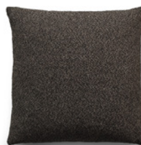
Lisbon color 11