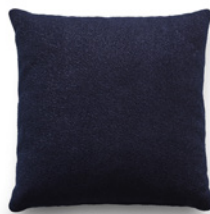
Bali color 14