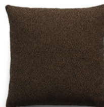
Lisbon color 03