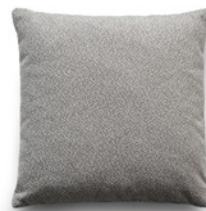
Lisbon color 37