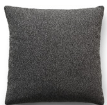
Lisbon color 06