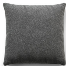
Bali color 16