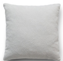
Lisbon color 20