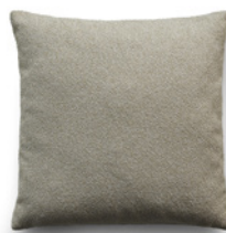
Lisbon color 07