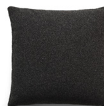
Lisbon color 16