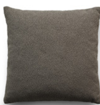
Bali color 17