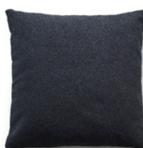
Lisbon color 04