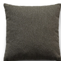
Lisbon color 09