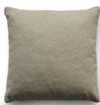
Bali color 27