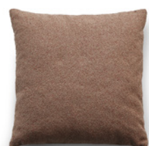
Lisbon color 22