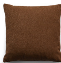
Bali color 03