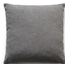
Lisbon color 26