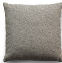
Lisbon color 21