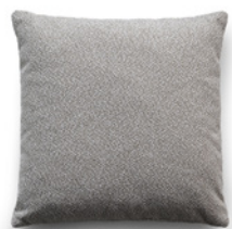
Lisbon color 27