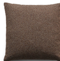
Lisbon color 23